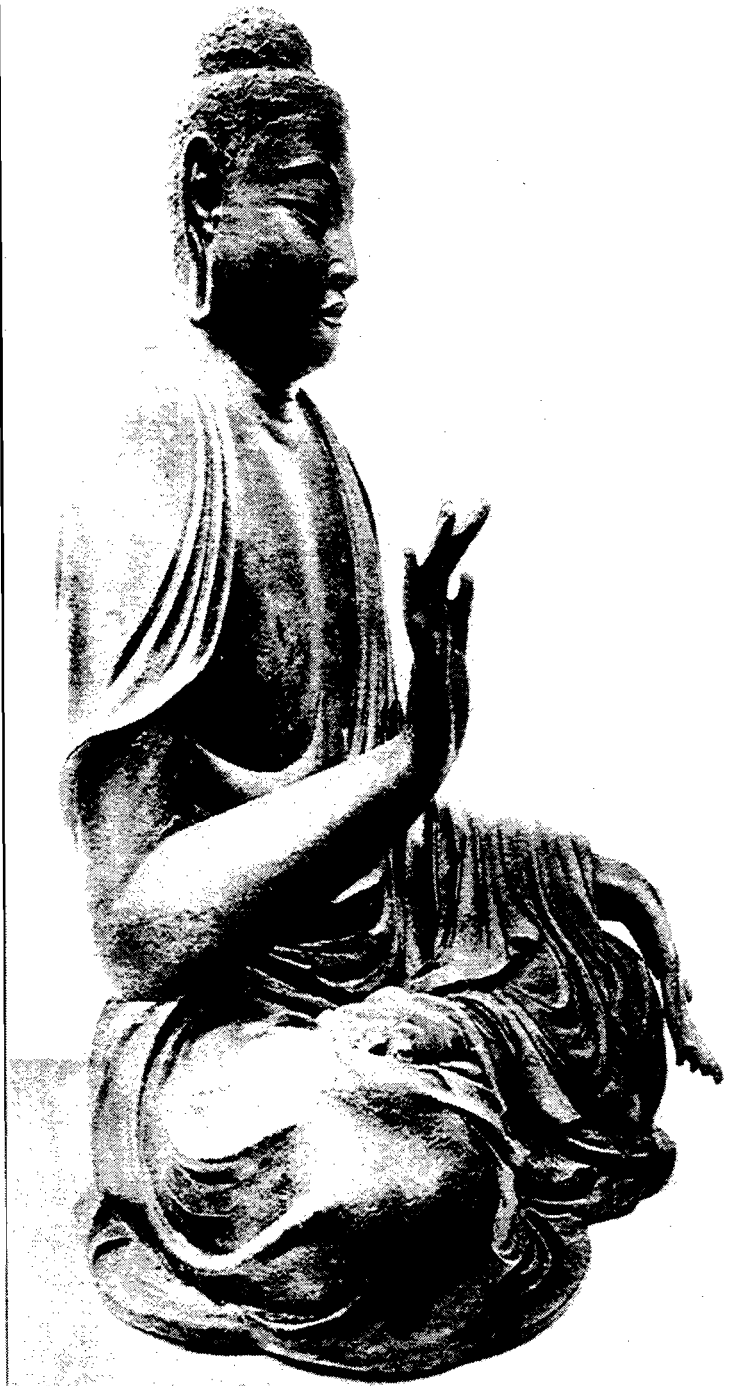
Sakyamuni Buddha, Jingoji Temple, Kyoto, Japan